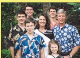
The English Family

Monthly Supporting Congregations & Organizations