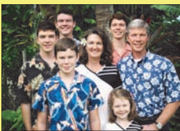
The English Family

Monthly Supporting Congregations & Organizations